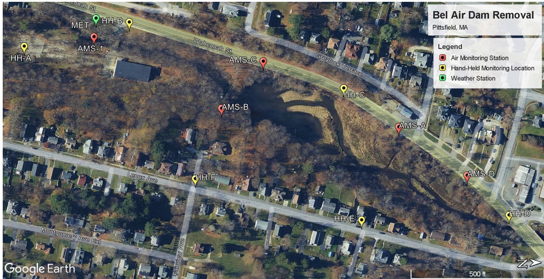
Figure 2: Site Map (1/20/26 – 1/23/26)